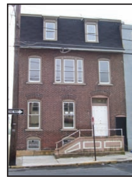
Chew Street Property Renovation Allentown PA