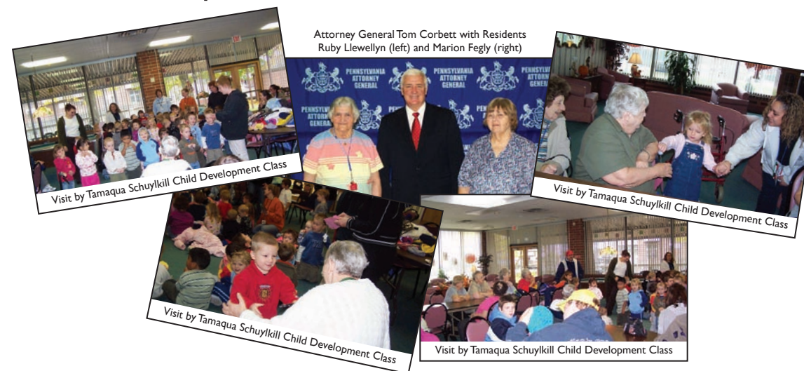
These photos are representative of the many events held each year at our Tamaqua Hi-Rise senior living facility.