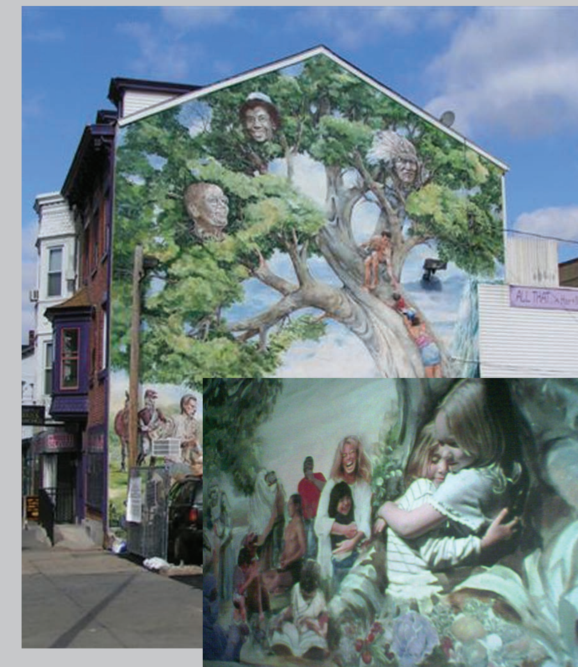
Detail of mural at bottom

A nonprofit community development and affordable housing corporation serving Lehigh, Northampton, Berks, Carbon, Monroe and Schuylkill Counties